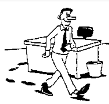
Take a few minutes to walk around the office