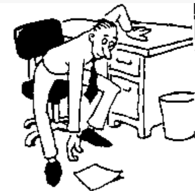
To pick up objects that have fallen to the floor, slide to the edge of your chair and place a hand on your knee or your