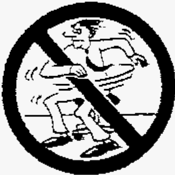
Avoid sudden, jerky movements.

When you're moving about at your desk, your back is vulnerable to injury. Sudden bends and turns pull stiff, tense muscles and cause nagging back pain. To help protect yourself, learn to watch your back when you make a move.