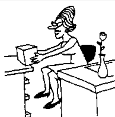
Turn toward things you need instead of reaching off to the side or pulling things toward you.