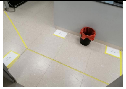
Floor labels to indicate separate work areas