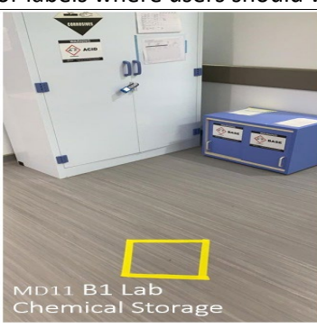
Floor labels for waiting when another user is at the shelf