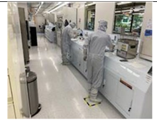
Floor label to indicate working positions