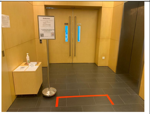
Floor labels to indicate waiting area