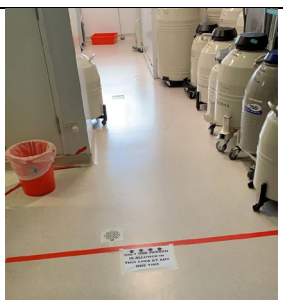
Floor label indicating that others should not enter if someone is inside