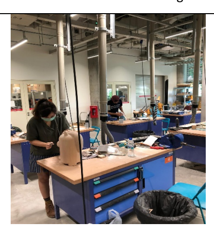
Working on separate benches