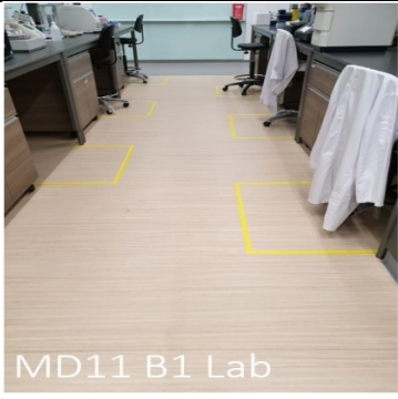
Floor labels for chairs / standing work