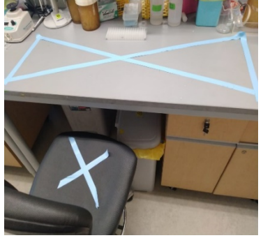
Labels for out-of-bound bench area and chair