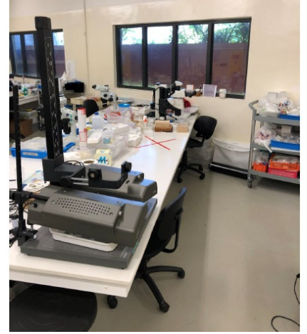
Excess chairs are removed to prevent overcrowding in lab